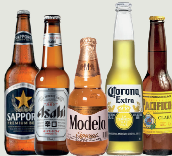
Not always available*